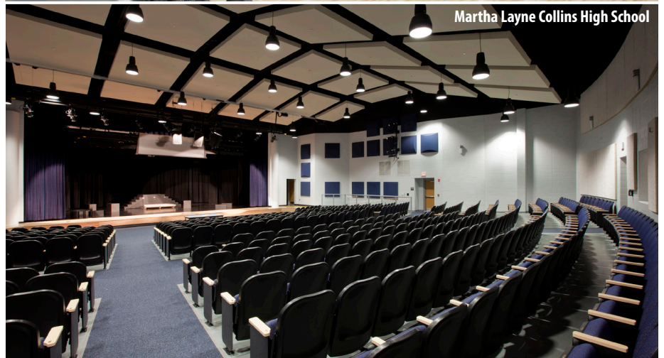
Martha Layne Collins High School

“ We have consistently been pleased with the services of Sherman Carter Barnhart Architects. They consistently demonstrate a priority interest of meeting our expectations and needs with high quality design and attention to detail. The firm has been attentive to integrating our new building designs with that of existing facilities. In a nutshell, we have been very pleased with Sherman Carter Barnhart on every project they have worked on in Laurel County.”