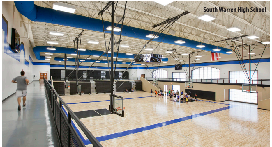
South Warren High School