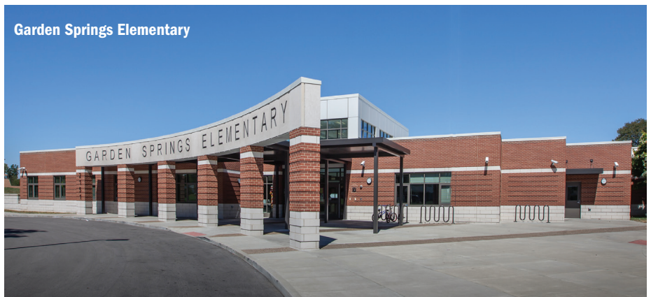
Garden Springs Elementary