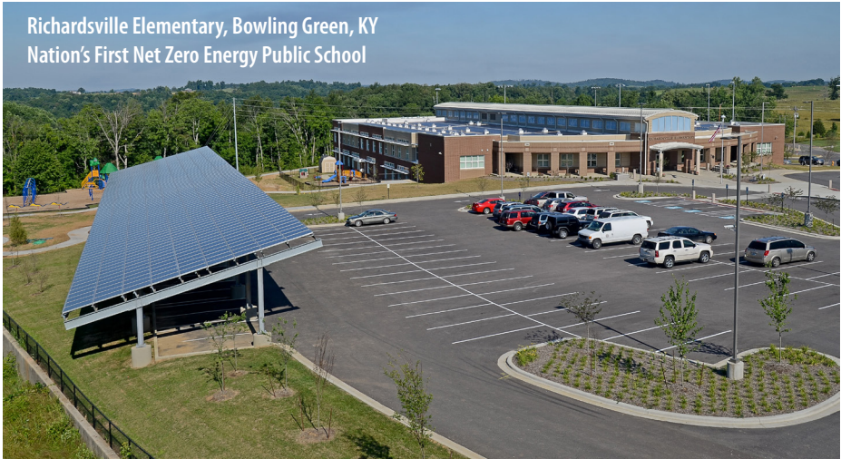
Richardsville Elementary, Bowling Green, KY Nation's First Net Zero Energy Public School