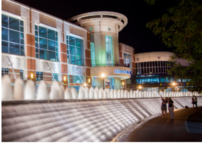
Kentucky Masonry Institute Excellence In Masonry - "M" Honor Award · Mason Source, Lexington, KY