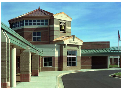
AIA Kentucky - Good Design Means Good Schools · Briarwood Elementary School Warren County Board of Education, Bowling Green, KY