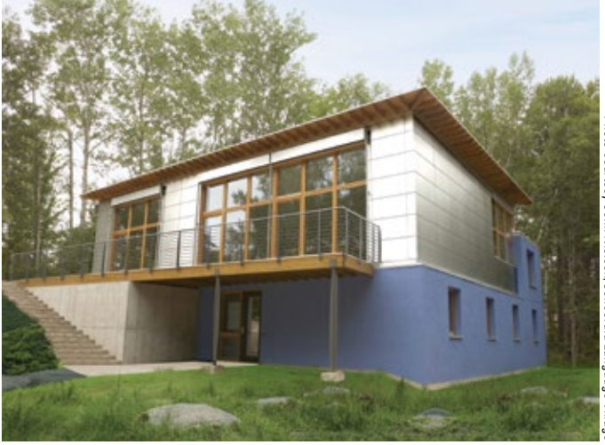
The first building in North America to be certified by Germany's Passivhaus Institute is the 5,000 sq. ft. Waldsee BioHaus in Bemidji, Minnesota. It used Amvic ICFs for all exterior walls.

When, in 2015, PHIUS introduced its own climate-specific passive building standards, it created a permanent rift between the organizations. The new PHIUS rules base efficiency on the number