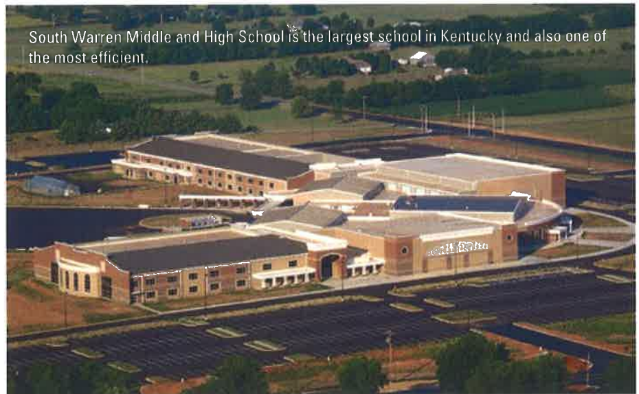
South Warren Middle and High School is the largest school in Kentucky and also one of the most efficient.

choosing a material with a high R-value, though, thermal mass plays an incredibly important role in reducing energy consumption. While the high R-value of ICF's resist internal temperature change, the high mass of the concrete wall system absorbs energy and stores it. This is critical in any climate where daytime temperatures