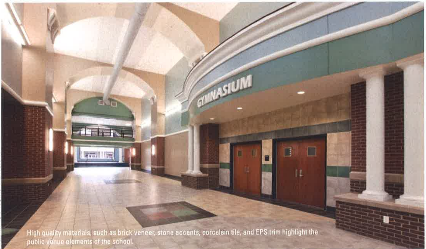
High quality materials, such as brick veneer, stone accents, porcelain tile, and EPS trim highlight the public venue elements of the school.

floors. The cafeterias and auditorium reach 35 feet.