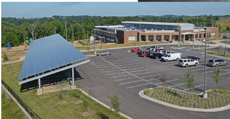
Richardsville Elementary in Bowling Green, Kentucky, was the first net-zero energy school in the United States.

The average monthly utility bill for an elementary school in the U.S. is $7,000. During one month that had eight sunny days, Richardsville generated enough solar energy to cover more than $4,300 in utility charges. The school also received a $300 credit for excess energy it generated and sold to the electric company.